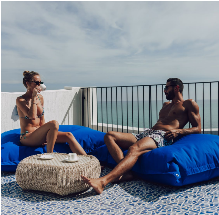
RELAX LINE PAG. 07-08