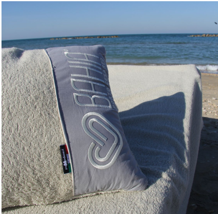
ADRIATIC COAST LINE PAG. 13-14