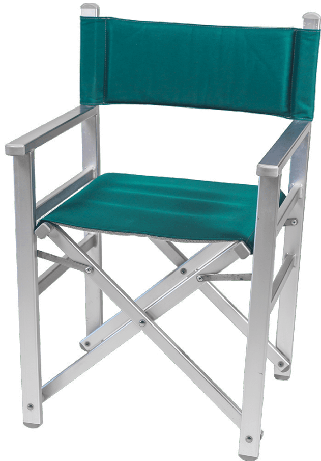
Padded canvas for director chair and deck chair These padded canvases have been designed to serve the needs of those who want to improve their beach furniture making them comfortable and welcoming for their guests.

PADDED CANVAS FOR DIRECTOR CHAIR SEAT 42X52 CM BACKREST 20X57 CM THICKNESS: 2 CM WEIGHT 2,00 KG