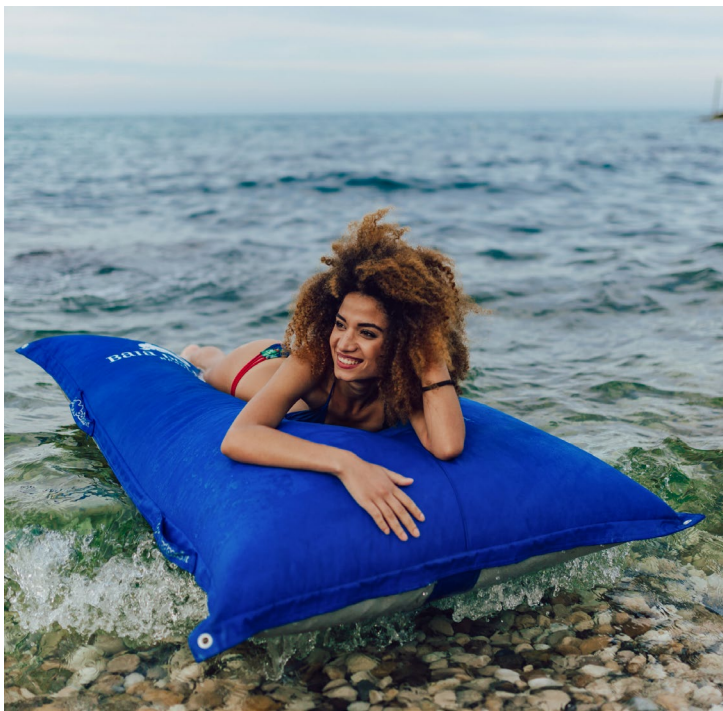
WATER LINE PAG. 15-18