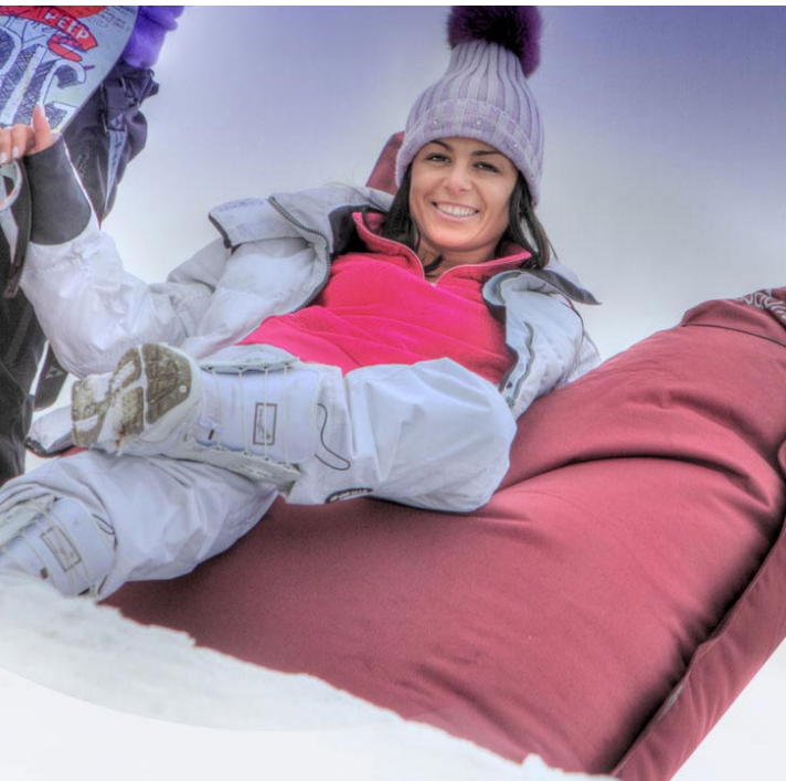
MOUNTAIN LINE PAG. 19-20