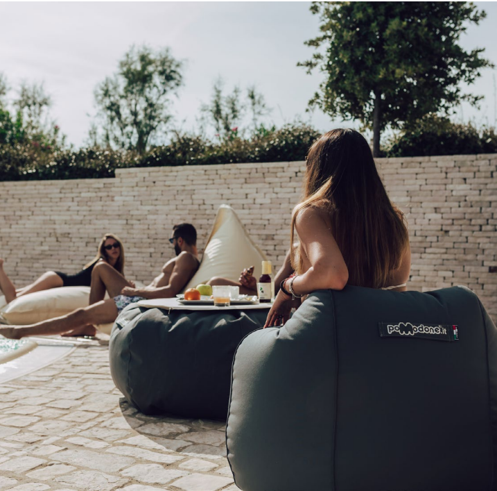
WHO WE ARE PAG. 01-04