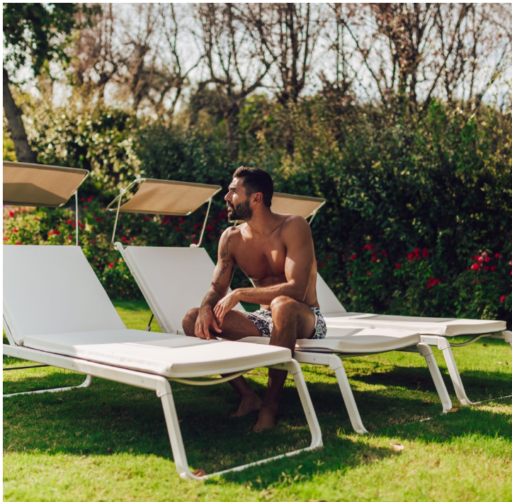
MAT AND FABRICS LINE PAG. 09-12